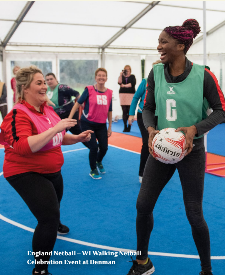
England Netball – WI Walking Netball Celebration Event at Denman